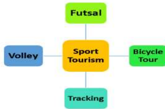
Chart-1 Sport Tourism Potential