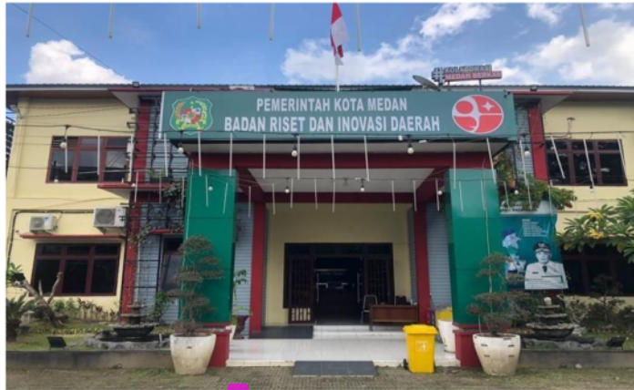
Figure 1. Medan City Regional Research and Innovation Agency Office

Results of research conducted on the Regional Research and Innovation Agency for the city of Medan in the context of support for the development of the city of Medan. This analysis aims to evaluate the contribution of the Medan City Regional Research and Innovation Agency in developing innovation and research that supports city growth.