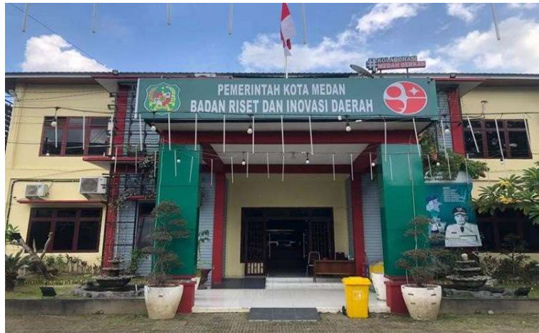
Figure 1. Medan City Regional Research and Innovation Agency Office

services, increasing regional competitiveness, and improving community welfare. Research, Development, Study and Implementation activities) are the main objectives of the presence of the Regional Research and Innovation Agency for the city of Medan, namely encouraging research and innovation at the regional and national levels. Advancing and improving the quality of research, development, study and application of science and technology is the main focus of activities.